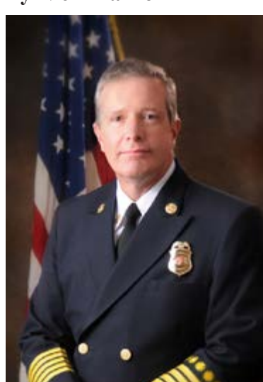
he Contra Costa County Fire Protection District was in dire need of strong leadership. The district had closed four fire stations after a failed 2012 parcel tax initiative, the labor group had tuned

out management, property tax rev- at things differently. ConFire is enue was flat and according to the county administrator, the district was headed toward bankruptcy. Lafayette, a city that accounted for more than $8 million a year in tax revenue, threatened to detach from the district after the closure of one of its fire stations and plans for a replacement station stalled. If that weren't doom and gloom enough, a consultant warned the county that the ConFire business model was unsustainable.